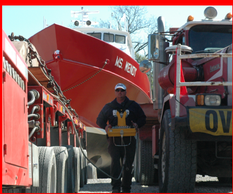
Launching a 250 ton crewboat into the Bayou Teche.