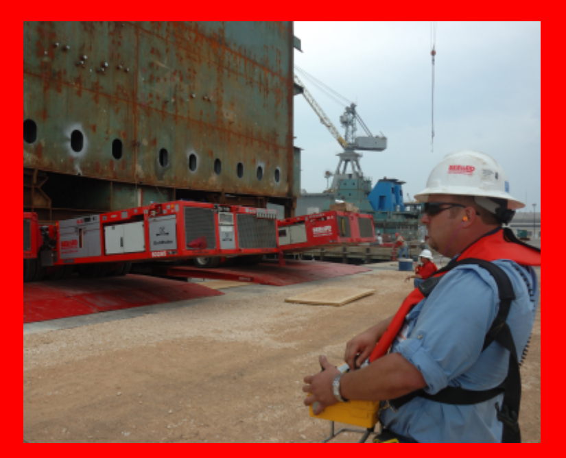
Moving 1700 tons, ... with his fingers.